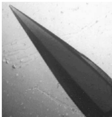
Figure 1 Native crystals of P450 MT2 (CYP121) grown by the hanging-drop method.